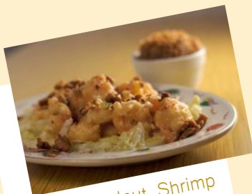
Honey Walnut Shrimp