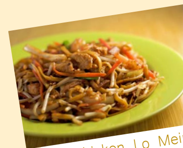
Chicken Lo Mein